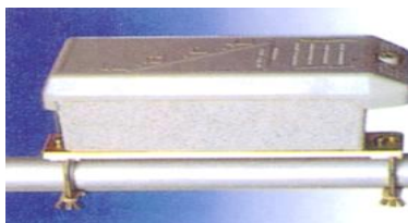
"MOUNTING BRAKET" with swinging block